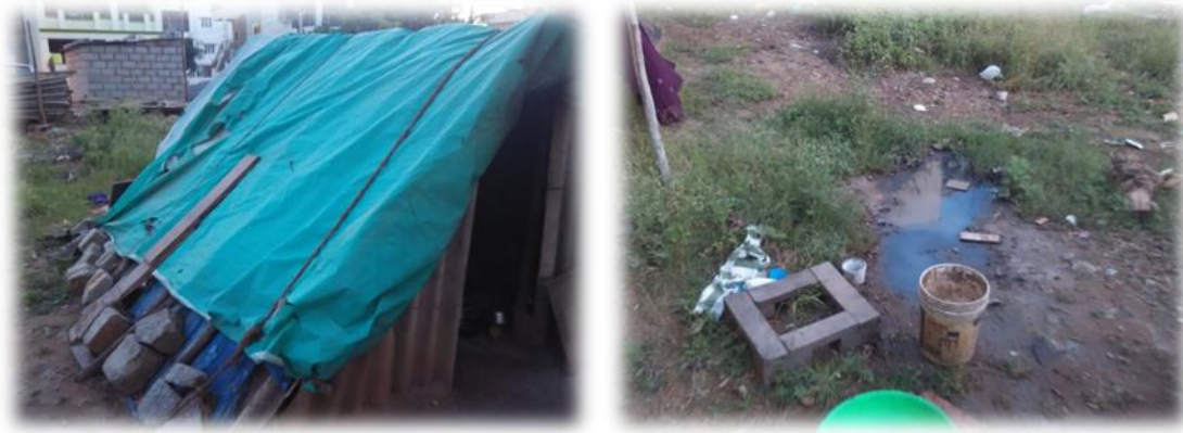
Migrants' shelter in Bangalore

construction companies like DLF and SRS. All these labour shelters had basic facilities of water, electricity and toilet.