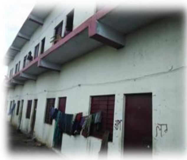
Hostel for migrant workers in Mysore

factories. Apart from industrial sector, migrants in Mysore were also engaged in construction, domestic work and petty trading. However in petty trading migrants usually were from north Indian states and in domestic work migrants were usually from neighbouring districts. Hotels and restaurants have also emerged as popular livelihood options for migrants, especially for inter-state migrants from Assam and other north-eastern states. The study team was advised by concerned personnel like officials and labour contractors to interact with migrant labour of Nazarbad area in Mysore city and industrial townships like Nanjangud, adjacent to Mysore. In the industrial townships, migrant labour usually lived at accommodation facility provided by their employer in or around the factory premises. Study was conducted in a labour colony of Nazarbad neighborhood of Mysore city; two labour colonies in Nanjangud industrial township, located in the suburbs of Mysore; and in the premises of renowned companies like Nestle and Reid & Taylor. In sum, 93 labour migrants, comprising 13 inter-district (from Yadgir and Koppal) and 80 inter-state, were interviewed in Mysore.