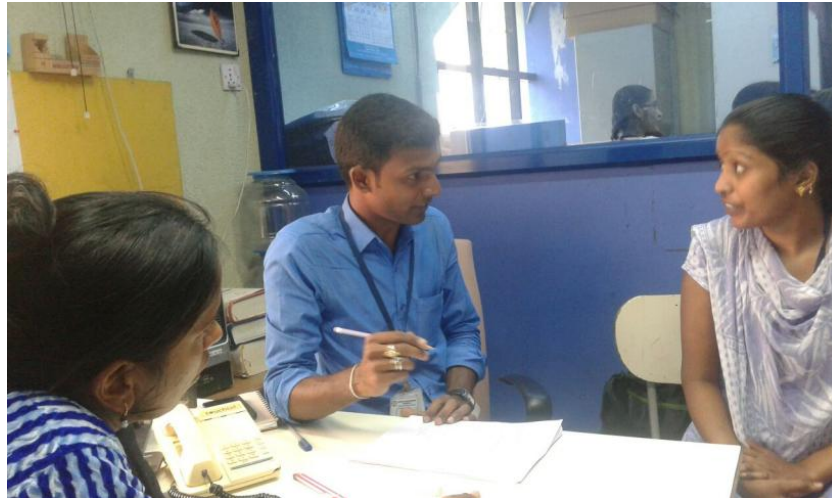
Field Researchers Facilitating an FGD at a Factory

was a registered contractor. He was from Yadgir and used to provide workers from few districts of north Karnataka, including Yadgir and Koppal, at construction sites of Bangalore.