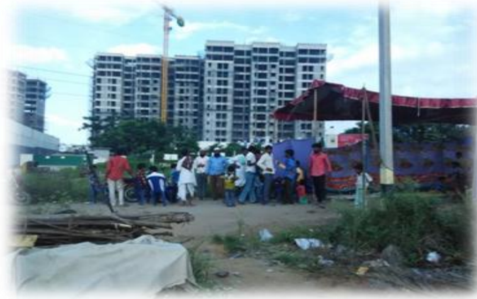
Workers of a construction site in Bangalore arranging for wedding ceremony

Rajrajeshwari Nagar. Study participants from Koppal comprised of labour migrants living in Bangarappa Gudde and Utharalli. Study participants from other states were primarily from Bihar, Jharkhand and Orissa. In total, 267 study participants were working in Bangalore.