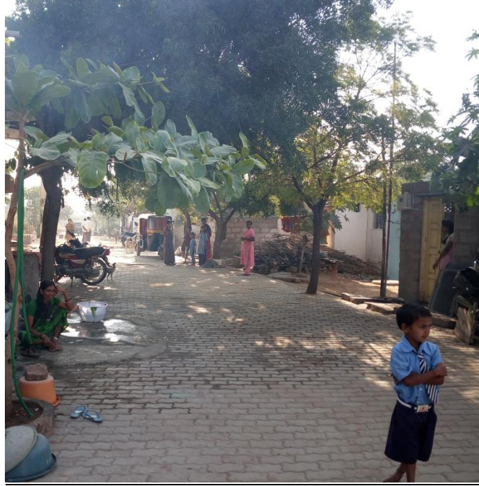
A migrant workers' neighborhood in Solapur

Solapur, a town with declining industrial significance, has not remained a popular destination for people from both Belgaum and Joida. The study team consulted officials of district labour office and visited neighborhoods of migrant labour like Pune Road, Mangalwada Road, Bhaiya Chowk, Mohadi's Jagjivan Ram Colony and Laskar (Sadar Bazar). Residents of these neighborhoods were mainly from districts of Maharashtra. Karnataka's migrant labour mainly hailed from Raichur and Vijayapur. Some of them were also from Gulbarga and Mysore. With the closer of some important factories of Solapur, the district's significance has drastically declined in recent past. It has not remained the popular destination for migrants. In fact, the district is now known as an important labour supplying district. Besides, wages in Solapur was reported to be less than Rs 300 for men (about Rs 280) and about Rs 250 for women (Rs 220-250). Labour in Karnataka usually got similar and in most of the cases higher wages than the common wage rate in Solapur. Finally, we interviewed 46 migrants from Karnataka's