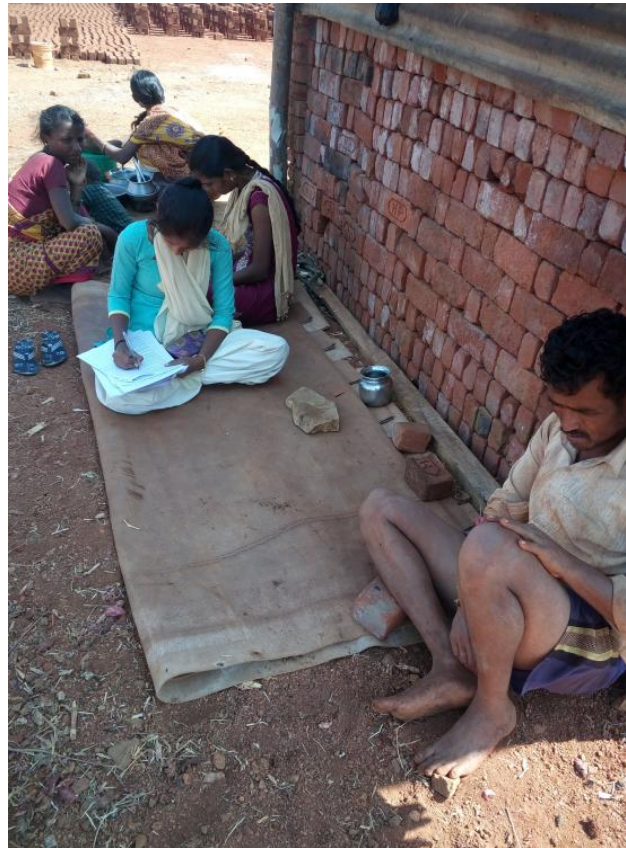
Brick Kiln Workers in Koppal

Koppal is a small district town of Karnataka and there are very limited livelihood options for migrant workers in the town. The study team visited Mehboob Nagar, Chukunal Road, Bhagyanagar, Ojanhalli Road and Vijay Nagar Colony in Koppal. Employment for labour was available only in few sectors such as brick kilns and construction sites and these avenues mostly attracted labours either from north India or from the town itself. People from surrounding areas of Koppal, both rural and urban, usually came to the town to work during the day time and returned back to their place in the evening.