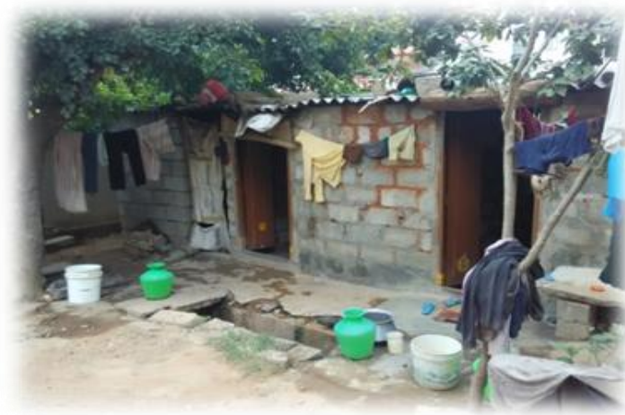
Workers' Home in Bangalore

Migration in Mysore is mainly concentrated in industrial townships around Mysore city like Nanjangud Industrial area, inhabited by many industries such as Nestle, Granite and Rubber