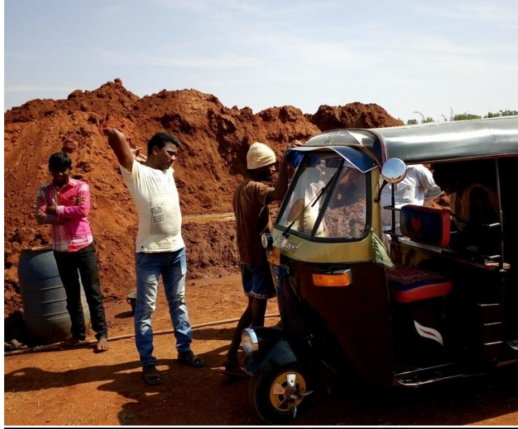
A group of inter-state migrant workers getting down at work site in Goa

But migrant labourers from these districts were not found in Solapur. The team even visited Belgaum district to get some sense of migration destination from Belgaum. The team consulted concerned officials in Belgaum town but could not get clear information regarding trend of migration from Belgaum to Solapur. Belgaum has emerged as a city of industrial significance with some important educational institutions and subsequently has become an important destination for migrants, for both labour and professional. One journalist of Belgaum shared that people from this district used to migrate to Solapur about a decade ago when the town was not safe for business because of rampant criminalization in town. In case of Joida taluk of Uttar Kannada district, people prefer to migrate to Pune, Goa and even Mysore and Bangalore.