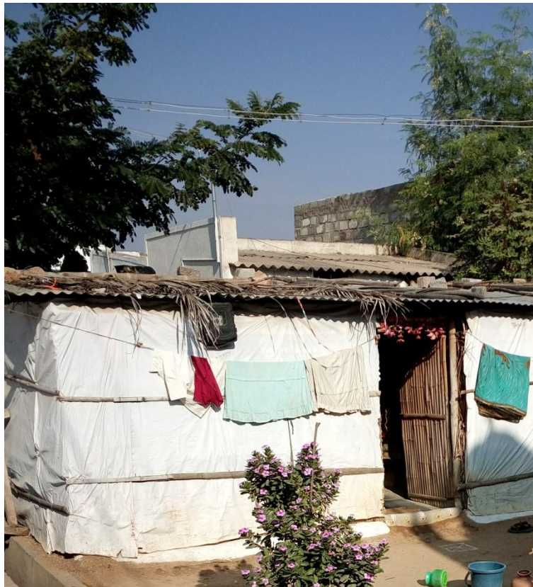
Intra-district Migrant Workers' Home in Yadgir

As noted earlier, finding recommended sample in Koppal, Yadgir and Solapur and even in Goa was a major challenge. The study team, comprising members of both CST and Field Researchers, visited several neighborhoods of these towns as per recommendations of local concerned personnel and officials they consulted to find the sample. Concerned officials and organizations were also of the opinion that labours from rural Yadgir and rural Koppal prefer to migrate to other districts and/or states or at least to the town of Yadgir and Koppal rather than another village of their home district. As noted earlier, after getting approval from KEA, we focused our study on migrants from rural Yadgir in the town of Yadgir and from rural Koppal in the town of Koppal.